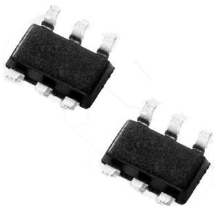
Figure 3. SDP Biased Series SOT 23-6 from Littelfuse

The SDP0240T023G6 provides a perfectly balanced broadband protection solution because it will not convert a longitudinal surge event into a differential event. This UL Recognized Component (file number E133083) is compatible with DSL bandplans up to and including the 30a bandplan (30 MHz) with turn-on response times of less than 500ns. Its off-state voltage of 19V with <100nA of leakage current makes it a good choice for use with Class H DSL line drivers, where the boosted supply voltage can force the DMT peaks up to +19V or as low as -5V.